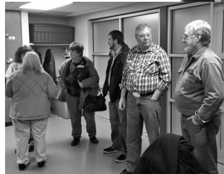
Friends and neighbors at the December 10, 2014 Holiday Party and Meeting