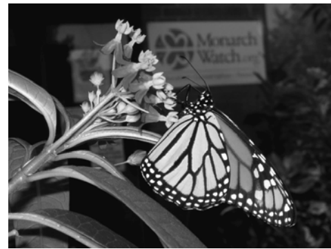
Monarch butterfly

Also, parsley and dill are easy to grow. Both plants support black swallowtail butterflies.