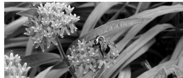
Bumblebee on butterfly milkweed

caterpillars on flowering milkweed plants. The Monarch Watch plant sale and open house is on May 7 at Foley Hall on KU west campus. The Grassland Heritage Foundation native plant sale is May 14 at the Lawrence Public Library lawn.