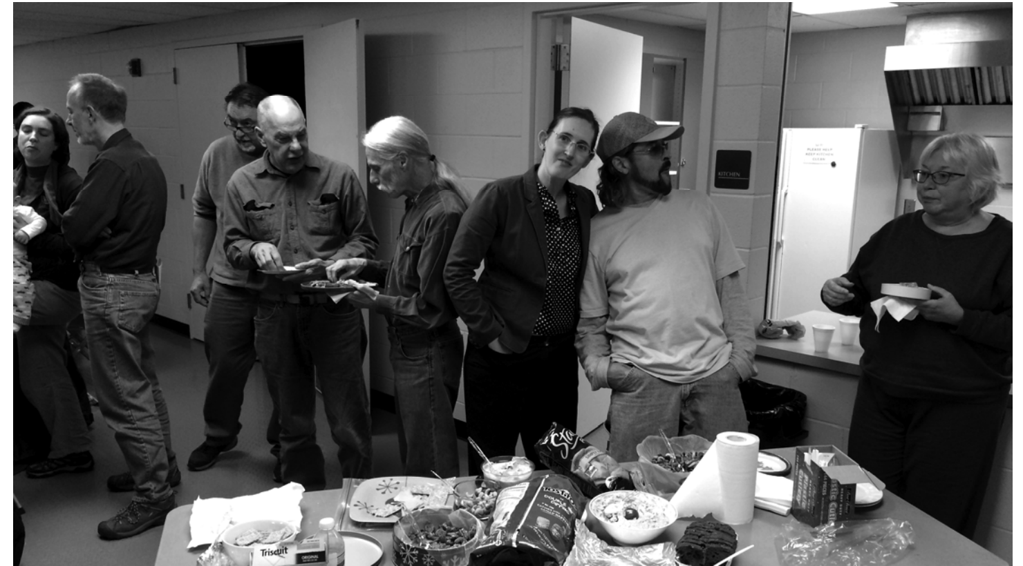
Neighbors gathered in December 2015 for annual officer elections and the Brook Creek holiday party.